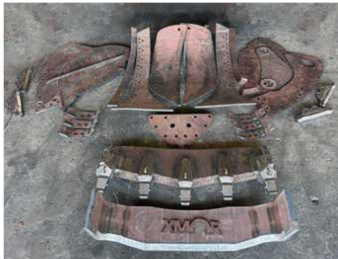
All buckets are repaired using Hardox® wear plate and Strenx® performance steel, assuring uncompromising quality and durability.